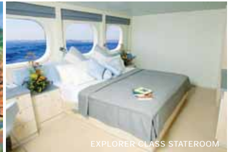
EXPLORER CLASS STATEROOM

North Star Cruises is the Kimberley's longest established adventure-cruise operator.