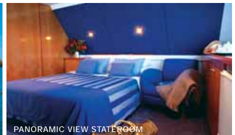
PANORAMIC VIEW STATEROOM

Travel the Kimberley coast from Broome through to Wyndham and everywhere in between. Experience the natural majesty of the Prince Regent, King George and Mitchell Rivers.