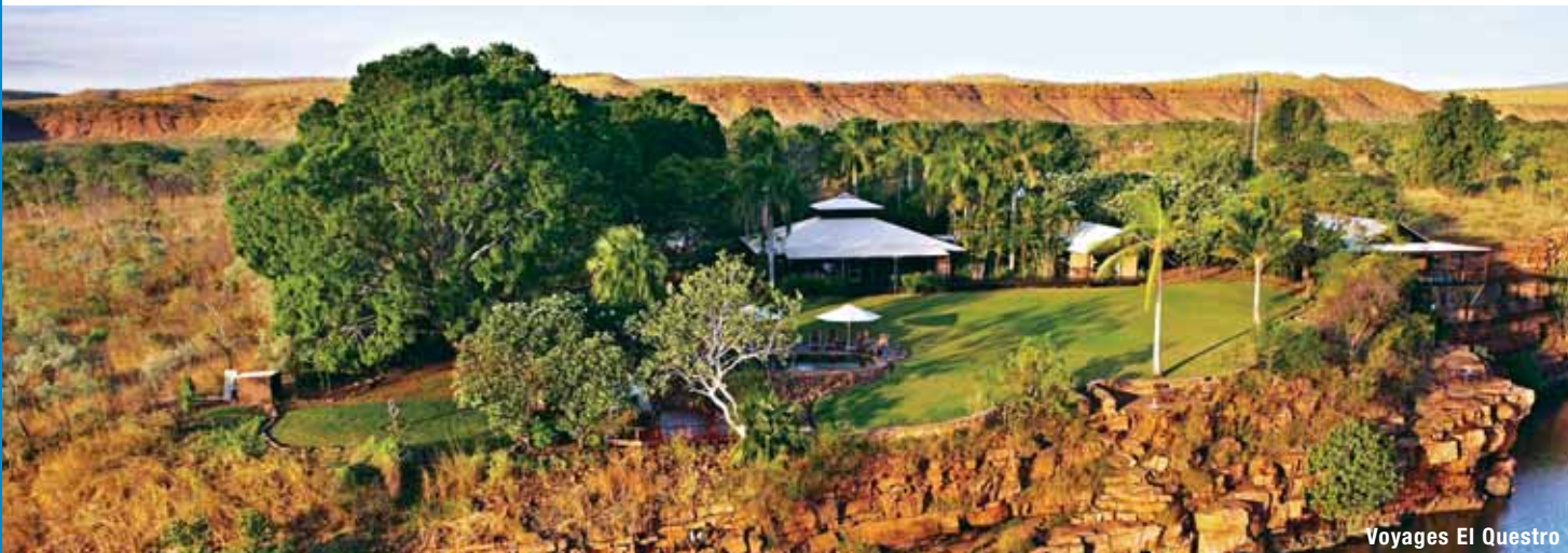
Voyages El Questro

Experience the ultimate Kimberley adventure by staying at one of the wilderness camps or working stations dotted throughout the Kimberley region.