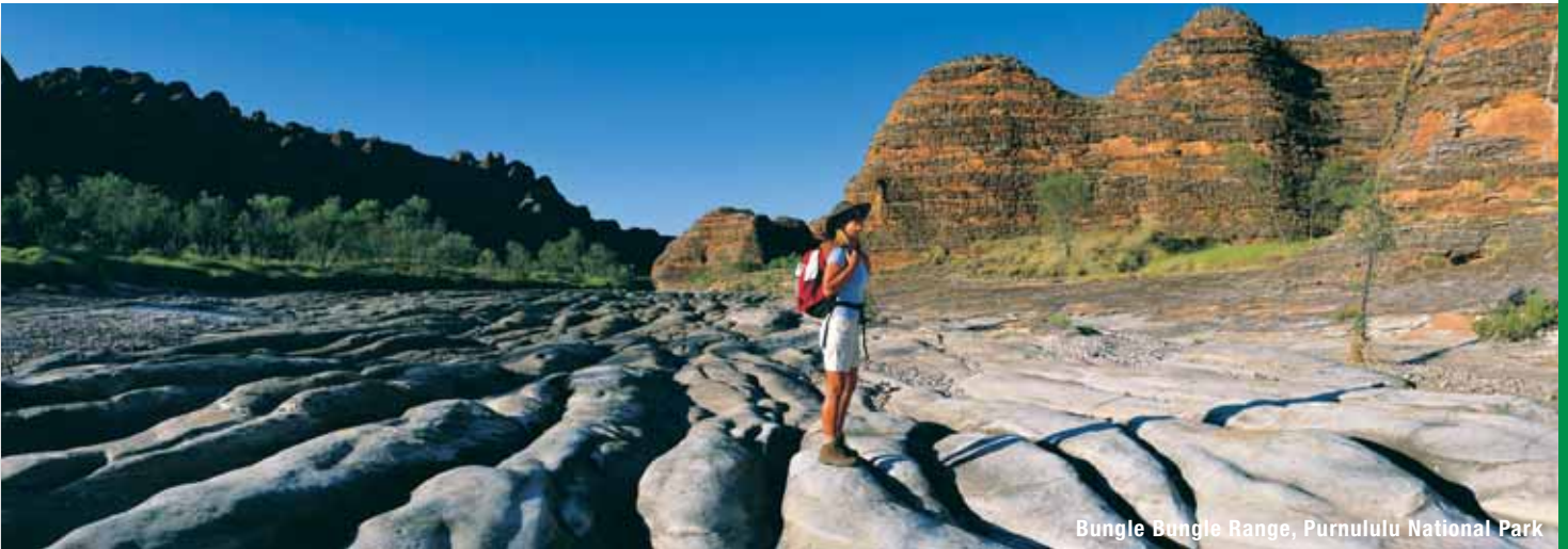
Bungle Bungle Range, Purnululu National Park