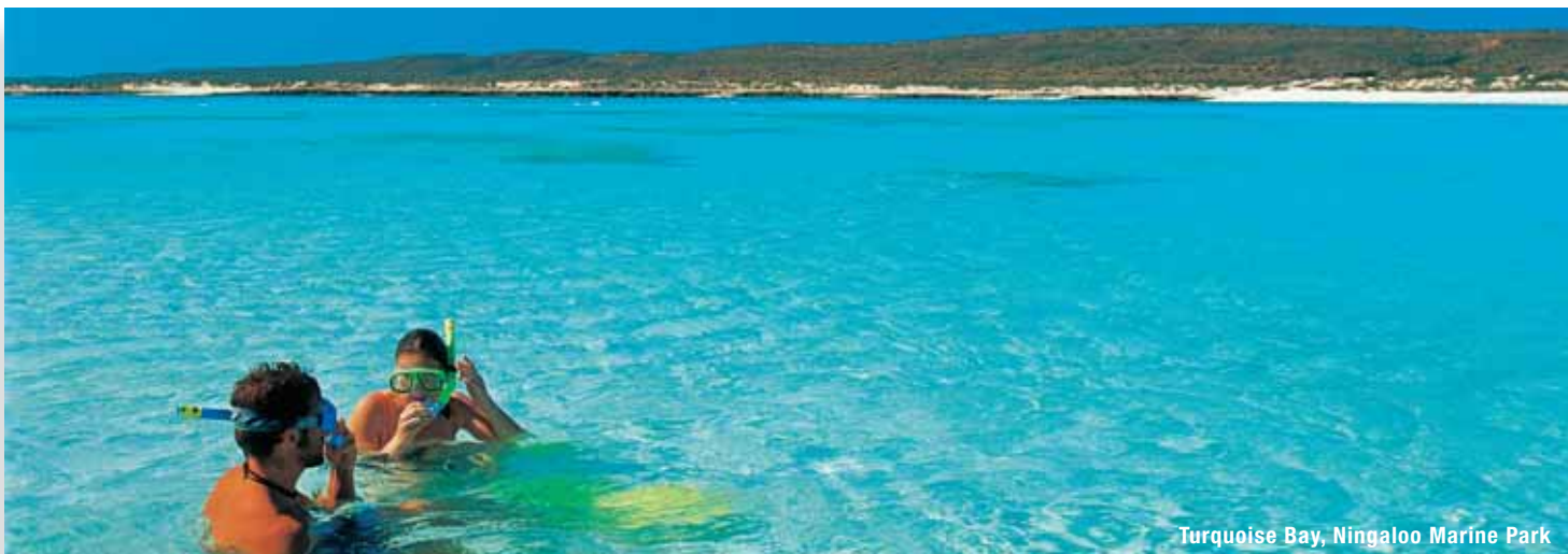
Turquoise Bay, Ningaloo Marine Park