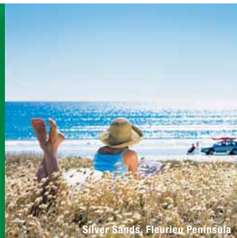
Silver Sands, Fleurieu Peninsula