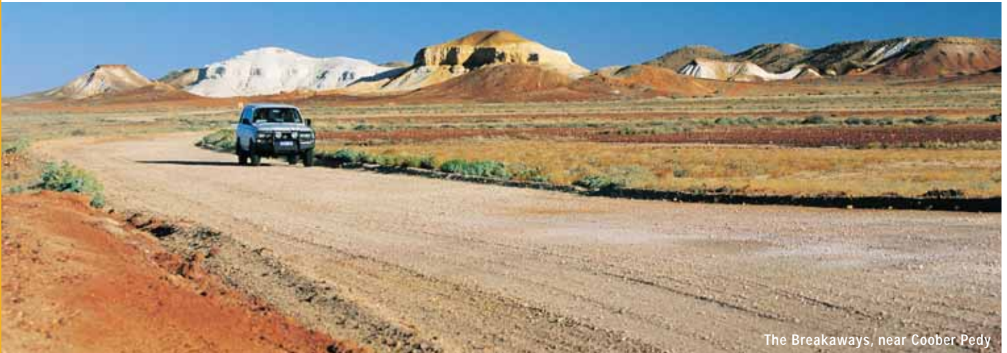
The Breakaways, near Coober Pedy

South Australia's Outback is a fascinating mix of breathtaking landscapes and intriguing characters. Coober Pedy is one of the world's leading opal producers and is a captivating town where more than half of the population reside underground.