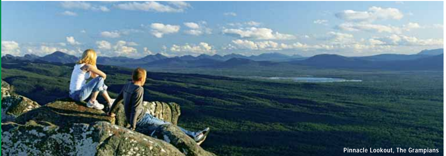
Pinnacle Lookout, The Grampians

The Grampians region is popular for outdoor activities offering a diverse array of wildlife, walking tracks and breathtaking scenery. The Grampians and Pyrenees wine regions are home to a number of leading winemakers including Seppelt.