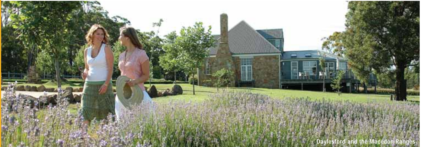
Daylesford and the Macedon Ranges

Home to the greatest concentration of naturally occurring mineral springs in Australia and an array of wonderful spa centres, the Daylesford and Hepburn Springs area is noted as a centre for relaxation, health, wellbeing and pampering.